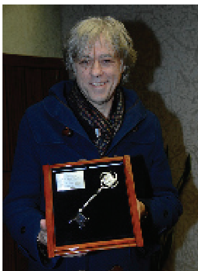
| Top Photo: Geldof speaks after accepting the 2009 International Award. Above, Left: Geldof with his 2008 International Award. Geldof with his Key to the City