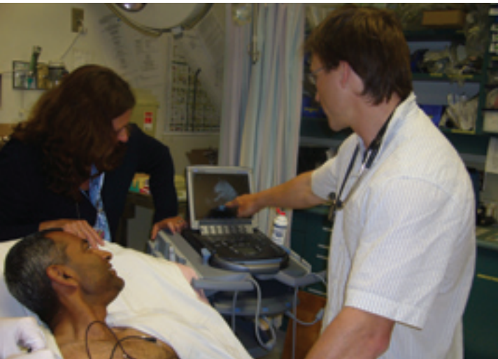
| A portable ultrasound, like the one purchased for Vascular Surgery, at use in the Emergency Department.

T HANKS TO THE THOUSANDS OF MANITOBANS who picked up their phones and made a donation on November 26, 2008, to the Radiothon de l'espoir, St. Boniface Hospital is celebrating the purchase of two new pieces of equipment which are improving patient care in the Cardiac Intensive Care Unit (ICCU) and the Vascular Surgery Program.