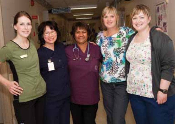
St-Boniface Hospital nursing staff.