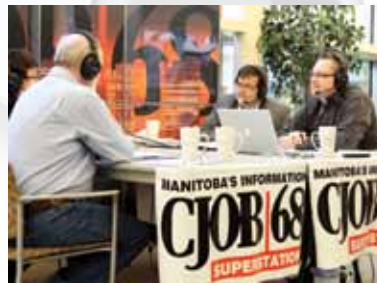
Radiothon of Hope and Healing Story on page 8.