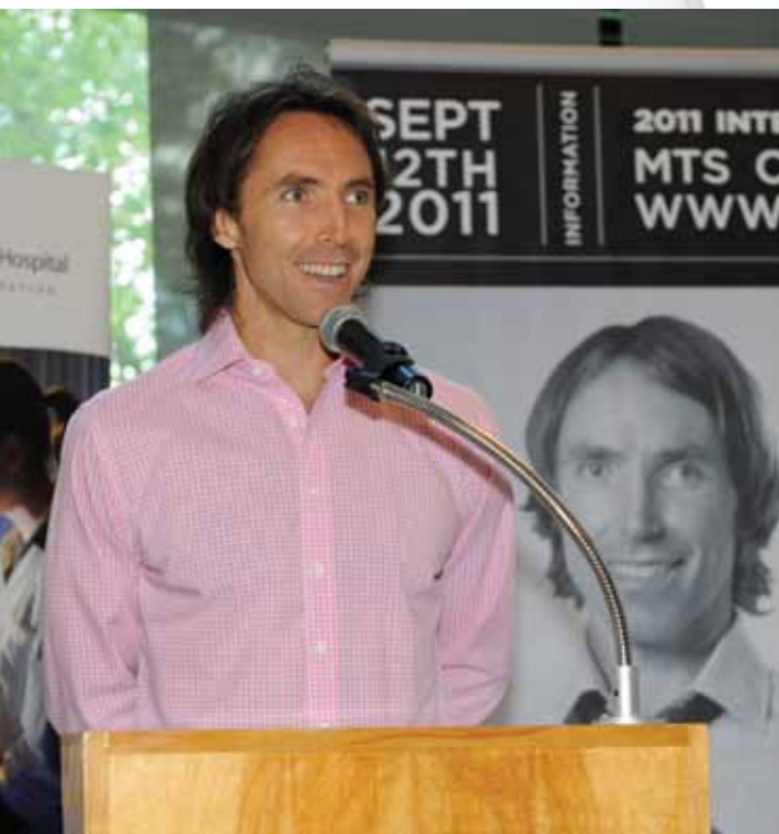
2011 International Award recipient: Steve Nash Story on page 2.