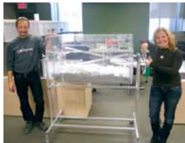
2011 Fall Cash Lotto Story on page 3.